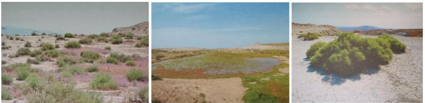
Fig. 1. Distribution of Ephemeral Plant Communities on the Breccia Surface of Mud Volcanoes

Ephemeral plant communities occupying breccia surfaces are shown in. These communities play an important role in early-stage succession and contribute to short-term increases in vegetation cover following periods of volcanic inactivity.