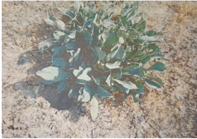
Fig. 2. Distribution of Limonium sp. around the Shekikhan Mud Volcano

In northern coastal areas, species such as Picris sirigosa , Astragalus bakuensis , Astragalus igniarius , and Cynodon dactylon are common. In certain localities, this vegetation belt expands to include Juncus litoralis , Phragmites australis , and Tamarix ramosissima . At higher elevations, species composition changes, with Ecballium elaterium and Capparis spinosa becoming more prominent.